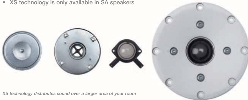
XS technology distributes sound over a larger area of your room