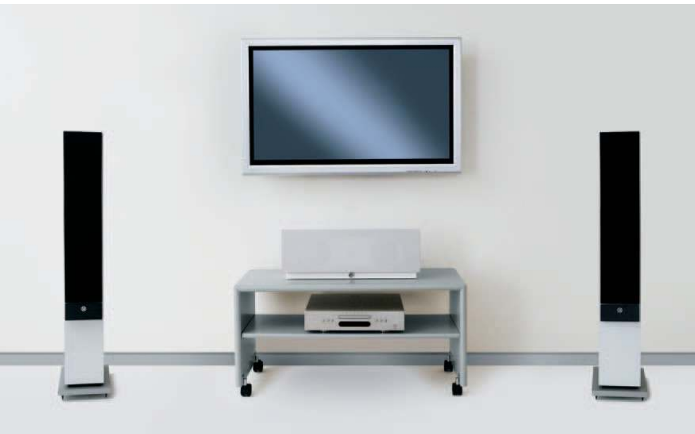
SA explorer as front speaker – SA exact used as centre and rear speaker