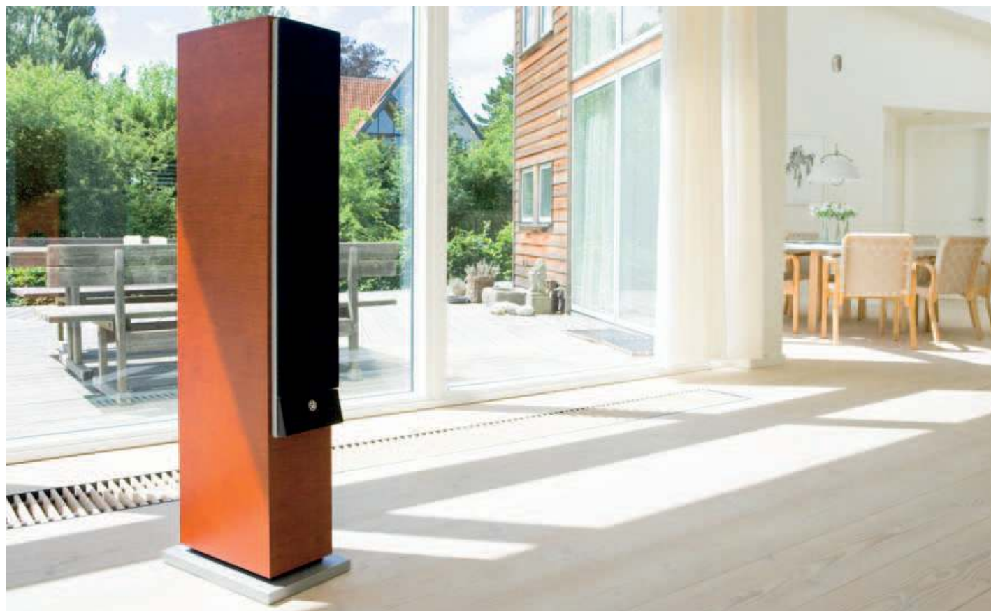
the surface consists of 42 pieces of real cherry veneer. The finish makes SA explorer more beautiful than most pieces of furniture