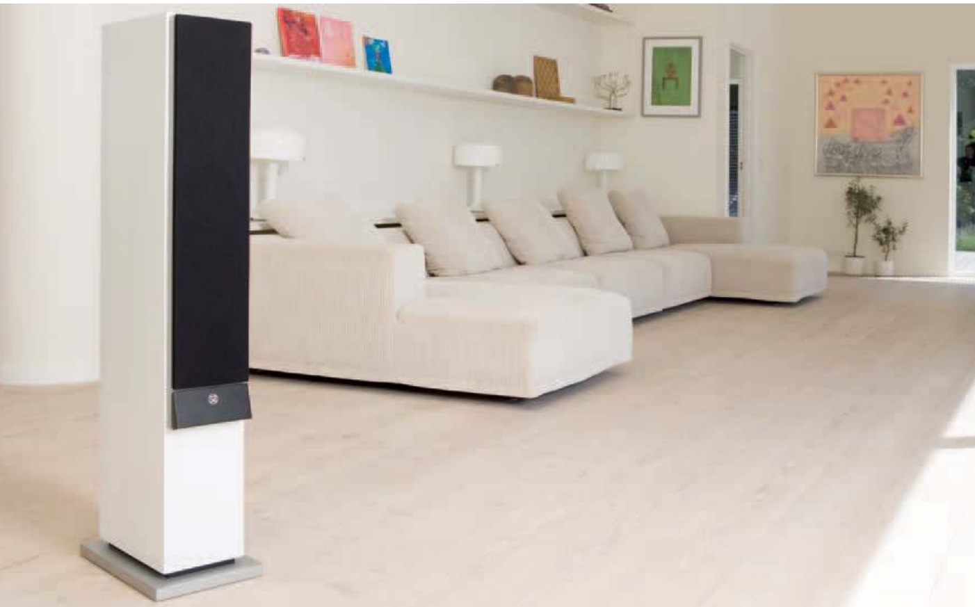
designed with durable simplicity. SA explorer in white satin enamel paint