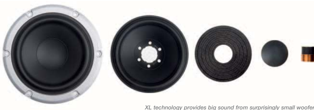
XL technology provides big sound from surprisingly small woofers