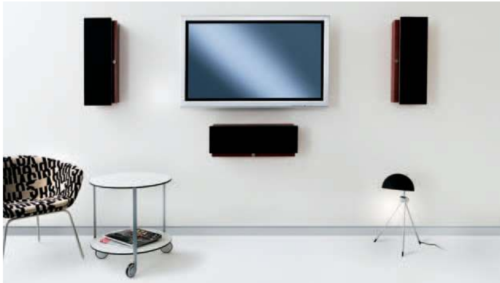
real cherry – classic and timeless