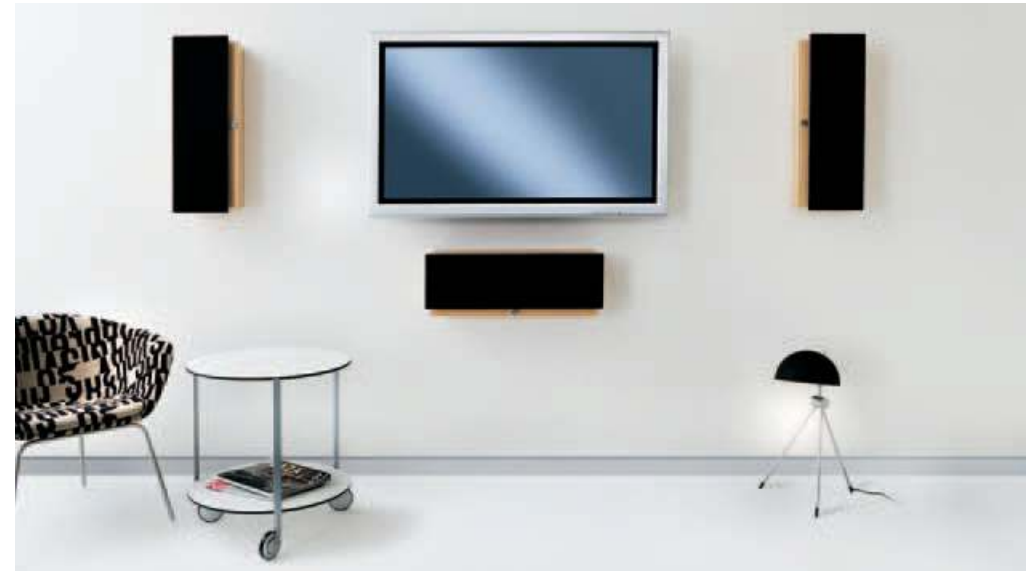
real maple – bright and modern