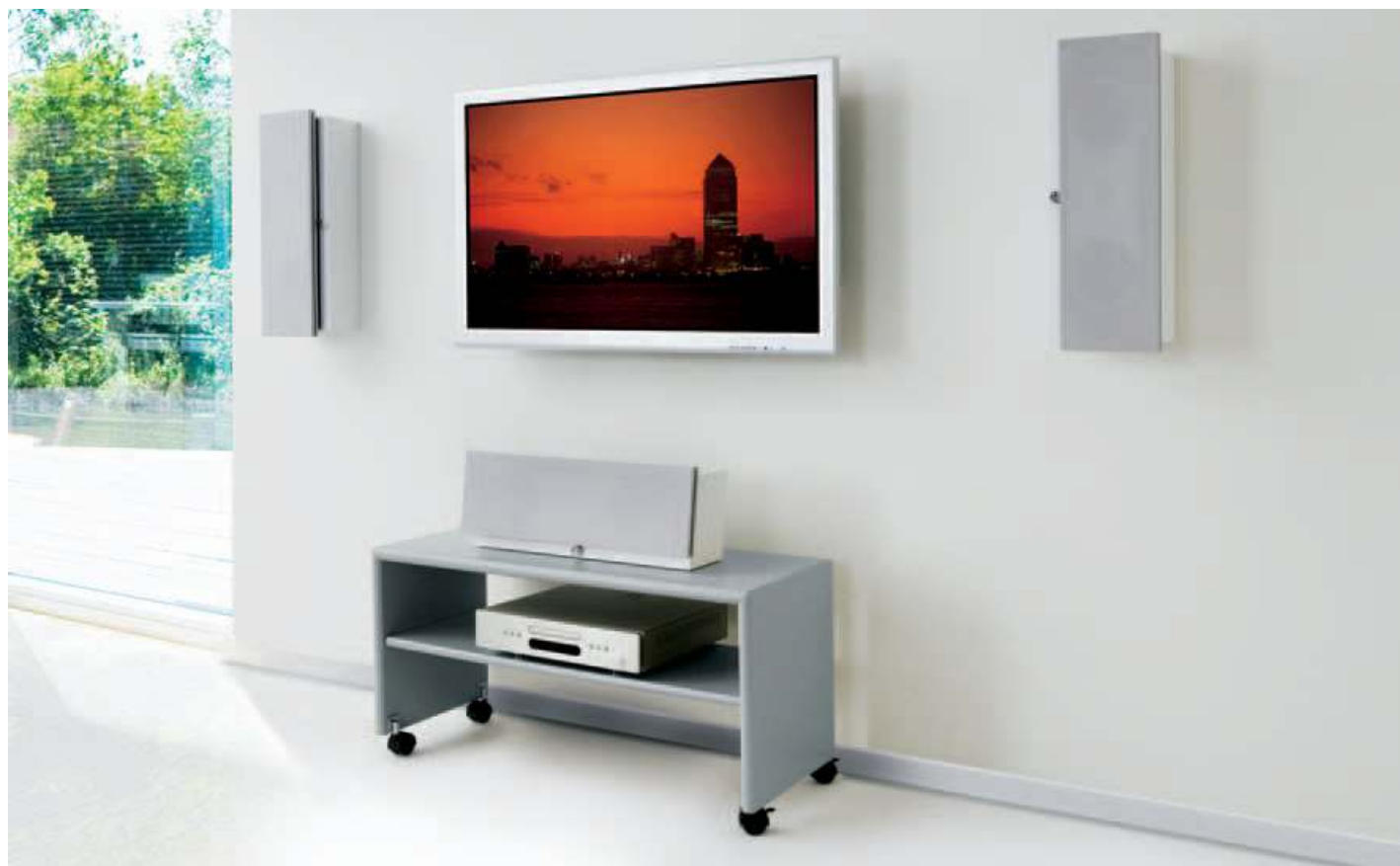
SA exact – the universal speaker with top-class sound

SA exact doesn't need help from its big brother to provide impressive, open and dynamic sound. It can do it alone, which makes it a serious alternative if you prefer to place your speakers on a shelf or mount them on the wall.