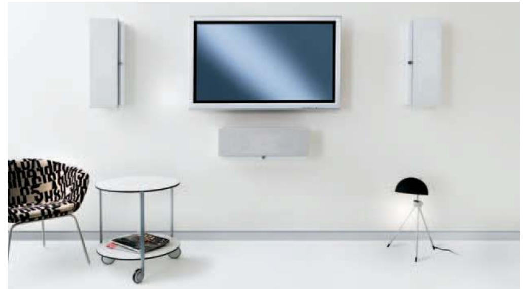
white satin enamel paint – minimalist and pure