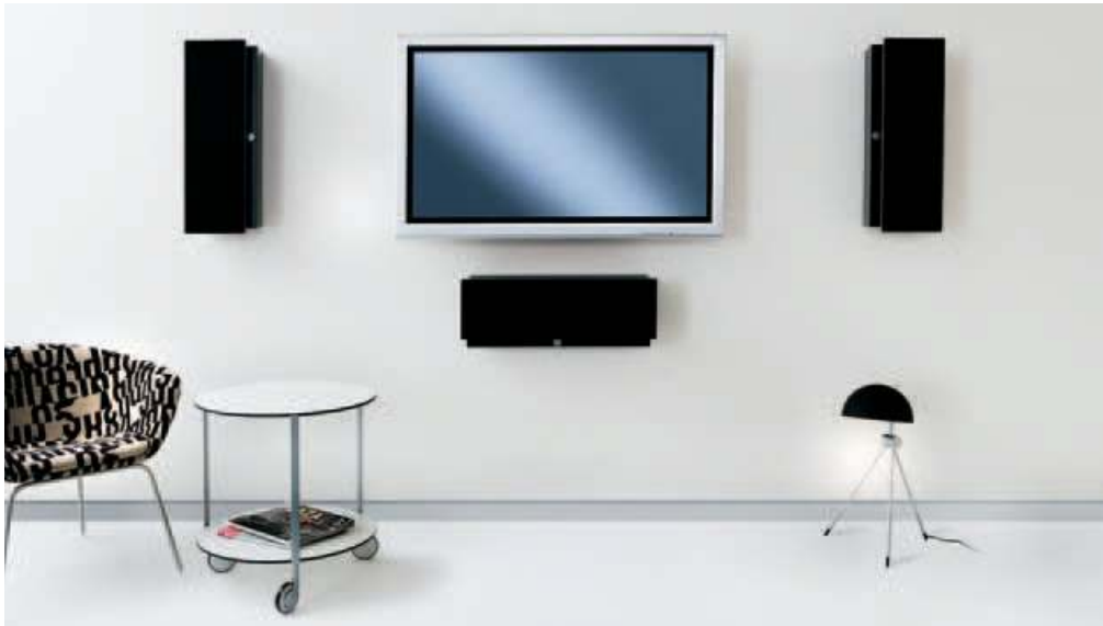
black satin enamel paint – remarkable and personal