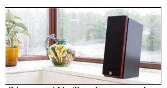
SA comet AV offers the same options for replacing front grilles and deco rings as SA comet