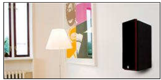
SA comet can be placed on the wall, on a shelf, a table or the floor

The only thing about SA comet that does not change is its big sound. Experience how you feel closer to the music, no matter what type of music you listen to. The sound is rich and warm, and the bass reproduction is nothing short of astounding for such a small speaker. The surprising bass is due, amongst other things, to the special hybrid reflex® system, introduced for the first time in SA comet. As part of a home cinema, it works well as either front or back speaker along with other SA speakers. SA comet AV is a variant of the normal model, designed for use as centre speaker in a home cinema.