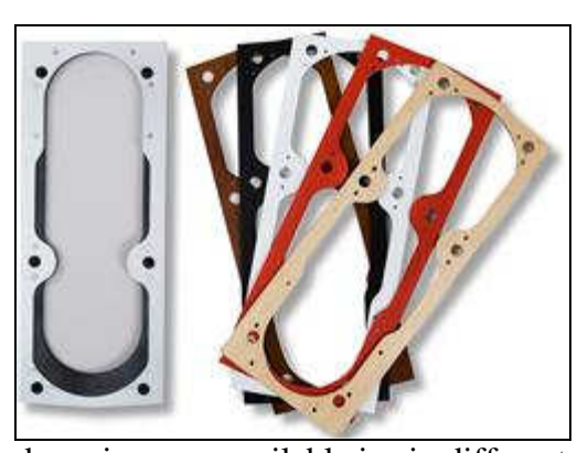
deco rings are available in six different finishes. They are mounted with small screws and are easy to replace

discreet, brave or exclusive? The most visible parts of the speaker – the front grille and the deco ring – can be replaced whenever you want