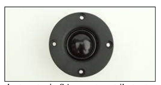
the tweeter in SA comet contributes to fine acoustics, which make the speaker easy to live with

characteristics of both. It has a bass port like a bassreflex speaker, as well as a passive membrane like a slave speaker. We call the technology hybrid reflex® - and the unique feature of this design is that hybrid reflex® makes it possible to reproduce deeper bass and to make the sound bigger and more full-bodied. Further information about hybrid reflex® technology is included in a separate article.