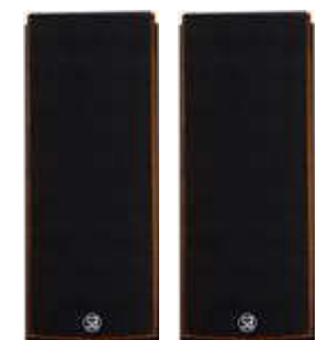
5.1 home theatre