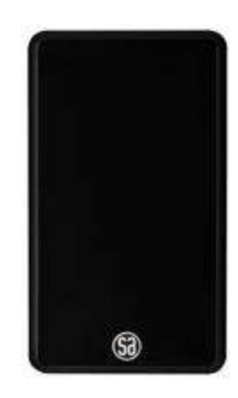
SA jiffy in black satin