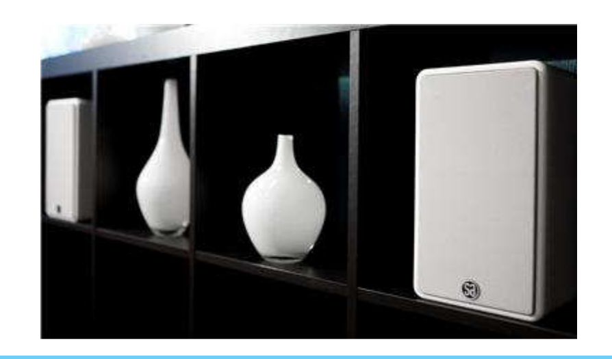
elegant. SA jiffy on the FS3 stand