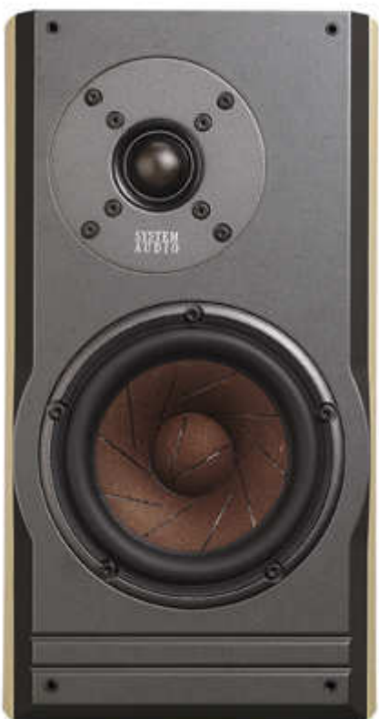
only 34.5 cm tall

The cabinet is the foundation of the loudspeaker. A stronger and more vibration-free cabinet gives the drive units better working conditions and thus a purer and more natural sound.