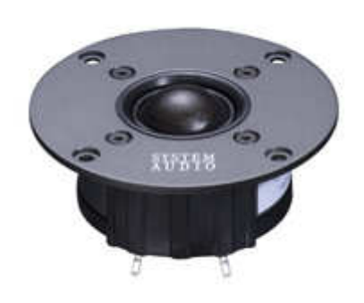
hver eneste diskanthøjtaler håndbygges, fintrimmes og kontrolmåles, for at opnå fine lyddetaljer