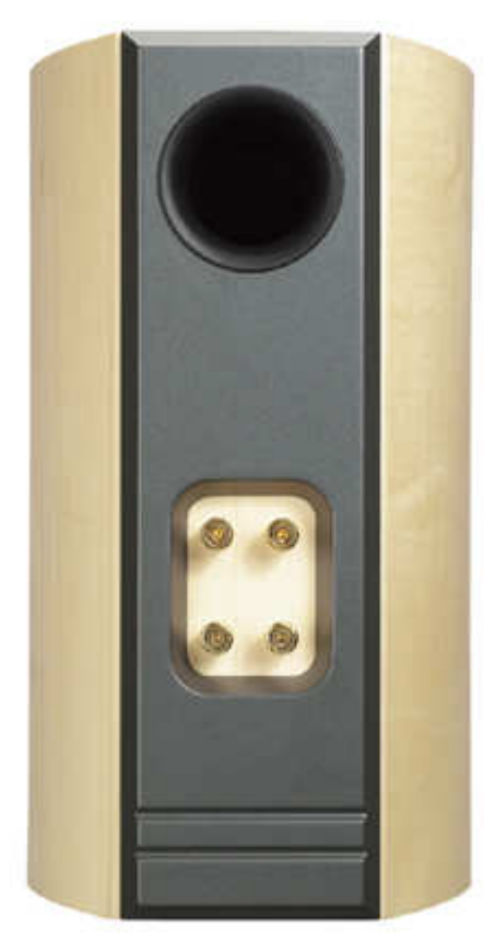
the rear is only 10.5 cm wide

SA2K master is the first loudspeaker in the world that has been built according to a new patented principle. Here the sides of the cabinets can be made curved, which increases the mechanical stability. The two sides, the rear and the front have been made from one piece of wood.