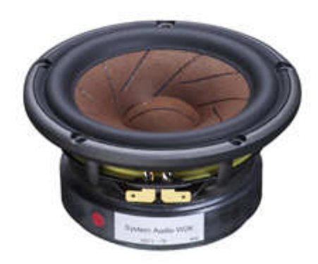
W2K. The unusual colour of the membrane is due to the five types of wood fibres.